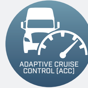
ADAPTIVE CRUISE CONTROL [ACC]