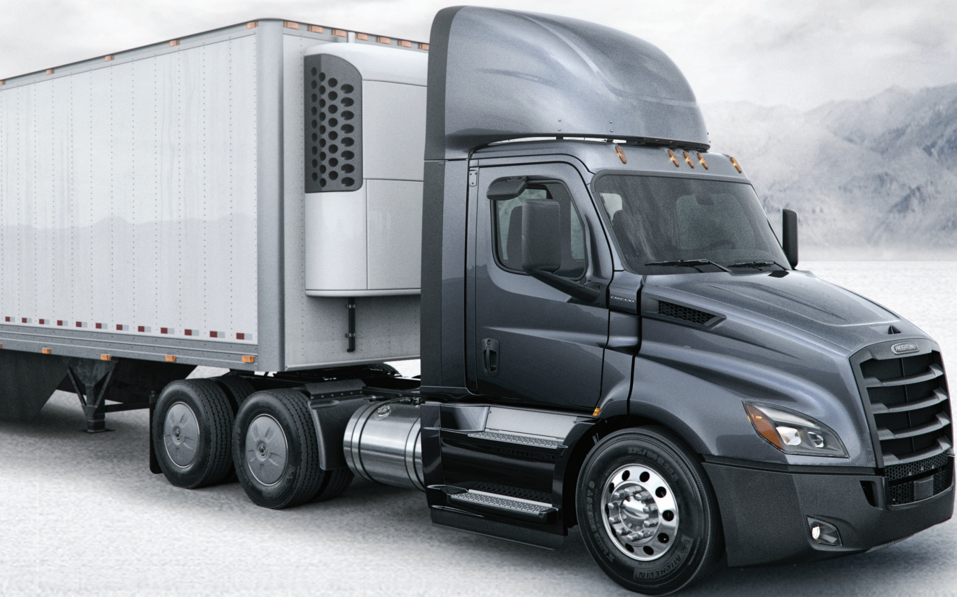
116" BBC DAY CAB SHOWN WITH PROFESSIONAL EXTERIOR APPEARANCE PACKAGE AND AERO AERODYNAMIC PACKAGE