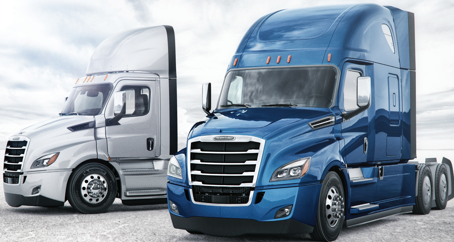
118" BBC DAY CAB SHOWN WITH ELITE EXTERIOR APPEARANCE PACKAGE AND AERoX AERODYNAMIC PACKAGE / 126" BBC 72" RAISED ROOF SLEEPER CAB SHOWN WITH ELITE EXTERIOR APPEARANCE PACKAGE AND AERoX AERODYNAMIC PACKAGE