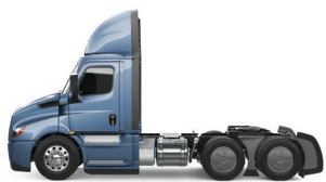
116" BBC DAY CAB