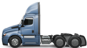
126" BBC DAY CAB