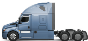
116"/126" BBC 72" RAISED ROOF