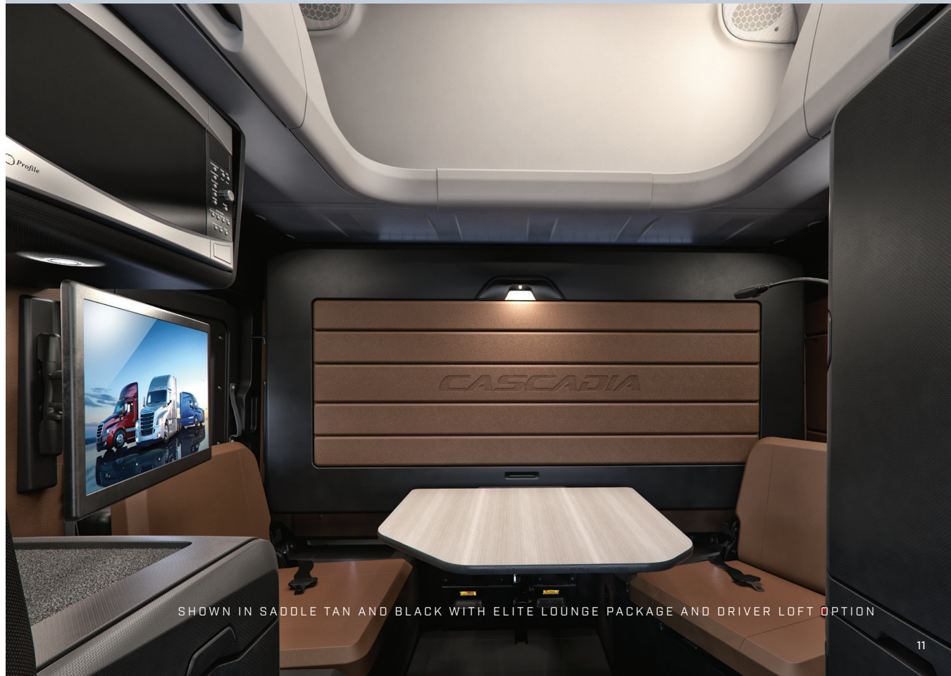
SHOWN IN SADDLE TAN AND BLACK WITH ELITE LOUNGE PACKAGE AND DRIVER LOFT OPTION

The new Cascadia offers several DC power outlets. However, if you need additional power in the sleeper, the new Cascadia offers a variety of powerful inverter and inverter pre-wire options that give power to AC-powered items.