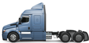
116"/126" BBC 48" MID ROOF XT