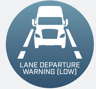
LANE DEPARTURE WARNING [LDW]

The new Cascadia is designed to be one of the safest vehicles on the road, one that protects the driver as well as other motorists. Equipped with the Detroit Assurance 4.0™ suite of safety systems, the new Cascadia can actively help drivers avoid accidents.