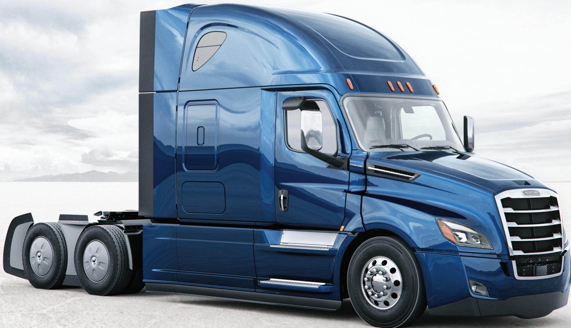
126" BBC 72" RAISED ROOF SLEEPER CAB SHOWN WITH ELITE EXTERIOR APPEARANCE PACKAGE AND AeroX AERODYNAMIC PACKAGE