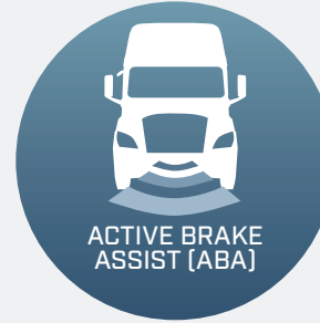
ACTIVE BRAKE ASSIST [ABA]